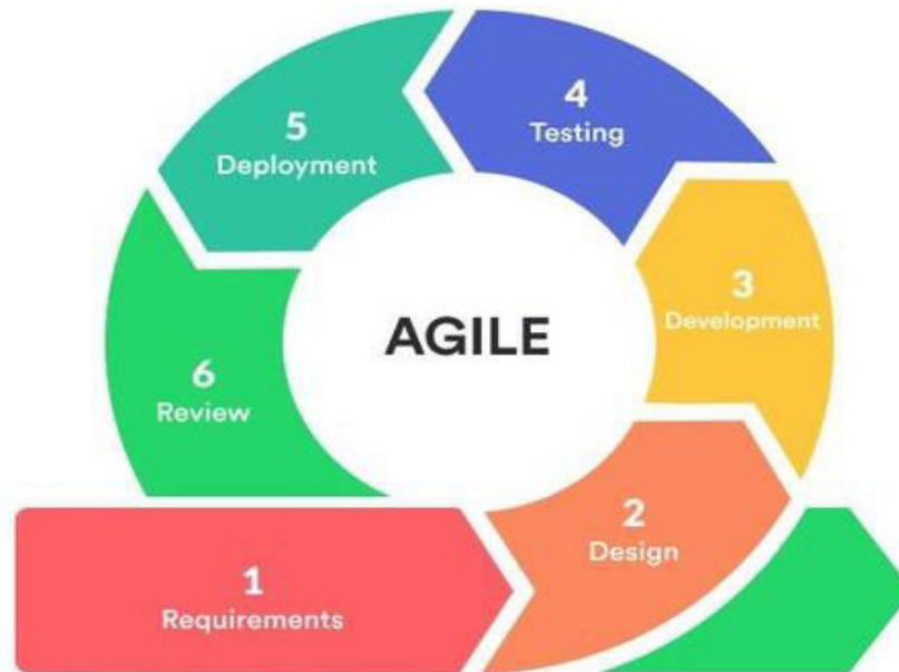
Figure 3.0 Agile Method

(A Monthly, Peer Reviewed, Refereed, Scholarly Indexed, Open Access Journal)